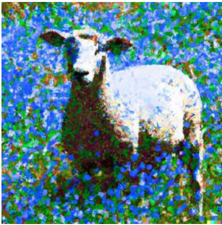
Fig. 1. “Pointillist painting of a sheep in a sunny field of blue flowers” prompt, DALL-E, version 2, OpenAI, 8 Mar. 2023, labs.openai.com/.

AI images could be used in a paper or presentation to provide examples or serve any other purpose of a visual aid, any use of which would need to be cited. The example below could be used in a paper about different art styles, for example if you wanted to demonstrate what pointillism was without finding an actual human-produced example of the style.