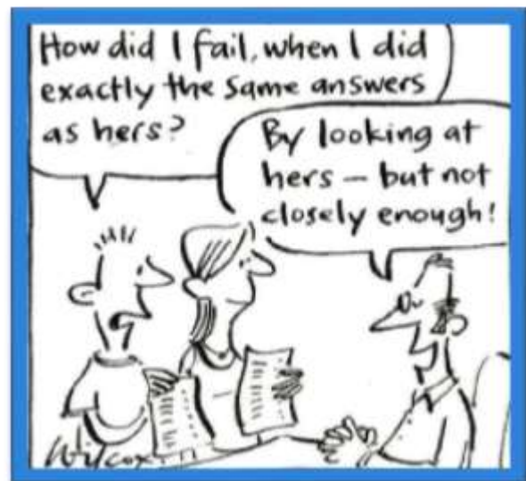
Illustration: Cathy Wilcox